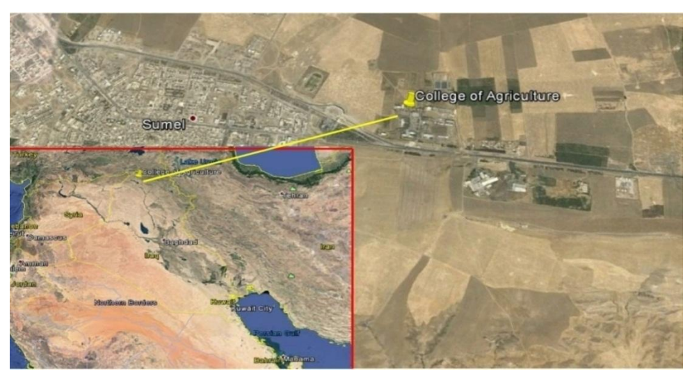
Fig. (1): Location of College of Agriculture Field in Duhok province - Kurdistan Region

The research was conducted at the field of College of Agriculture/ University of Duhok (Latitude: 36°51 '32.39"N) and (Longitude: 42°52'58.95"E) elevation (473m) (Figure 1). The study area categorized as a semi-arid region (Peel et al, 2007). Furthermore, the mean of temperature for 2015-2016 was 26 °C with precipitation (386mm) that started on October and ended on May (Youssef et al, 2017).