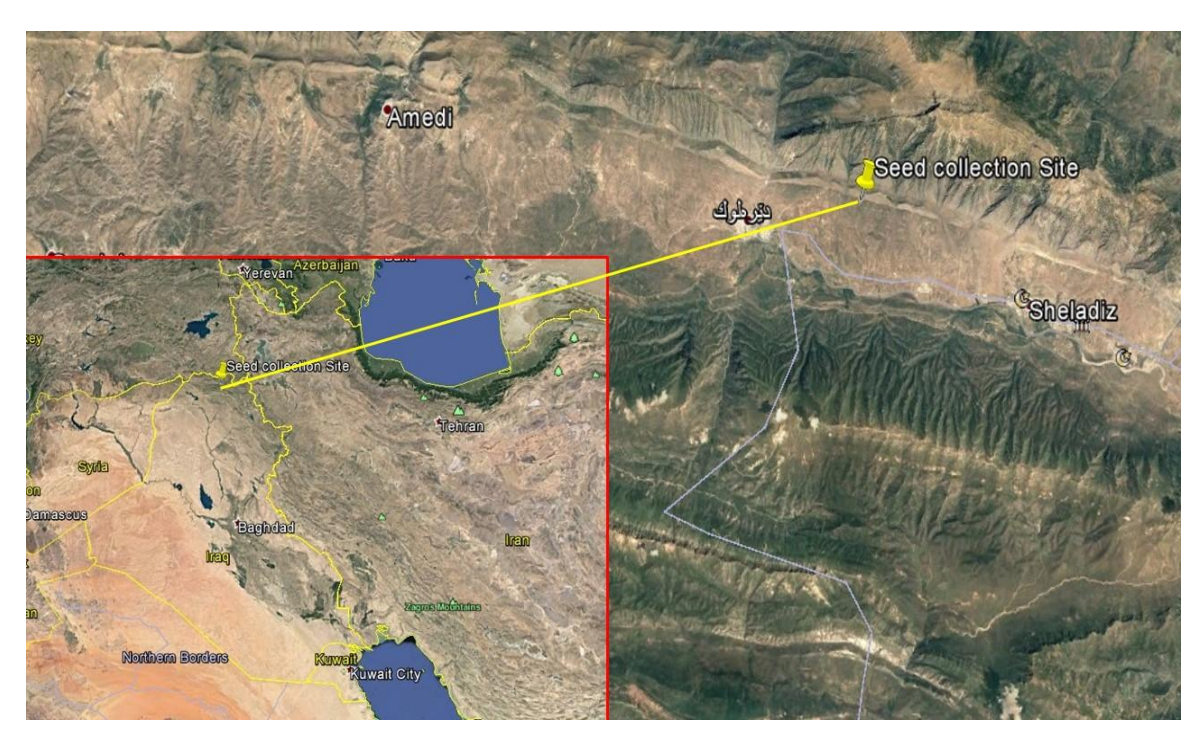
Fig. (2): Seed Collection Site, Deralok District, Duhok province – Kurdistan Region-Iraq