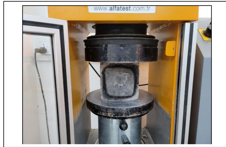
Fig.( 4):- Sample from mix HSGC-4 after being subjected to 1000 °C