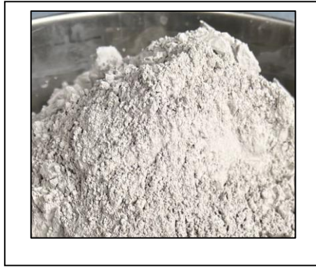
Fig.( 1):- Physical appearance of the GGBFS.