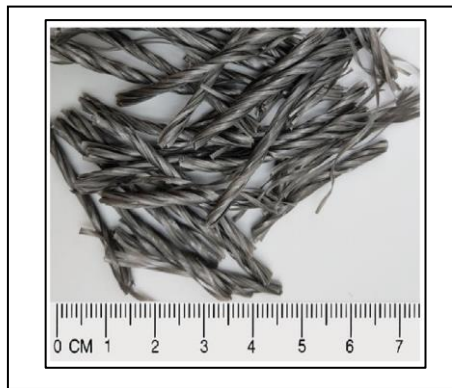
Fig.( 3):- Physical appearance of the PP fibres.

FA on the other hand is a fine, powdery by-product obtained from the combustion of pulverized coal in coal-fired power plants. The appearance of FA is illustrated in Figure 2. It consists of inorganic mineral matter present in coal that becomes suspended in the flue gases during combustion and is collected as a residue. The use of FA in concrete offers several benefits. It improves the workability of concrete, reduces water demand, and enhances long-term strength and durability.