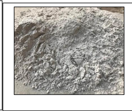
Fig.( 2):- Physical appearance of the FA.