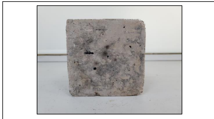
Fig.( 6):- Cracks on the surface of the sample after being subjected to 500 °C

Samples exposed to a temperature of 500 °C showed cracking on the surface of the samples as shown in Figure 6. This is mainly due to shrinkage of the sample material as the moisture escapes it as well as due to thermal stresses. Furthermore, the increased temperature appears to have damaged the cementitious matrix which is evident from the reduced strength.