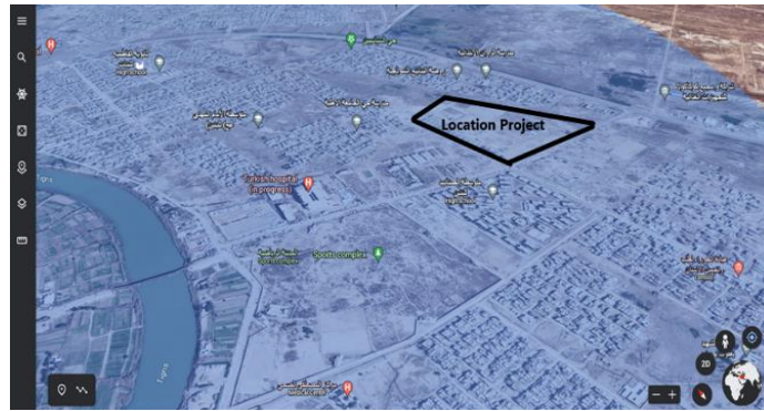
Fig.(1):- The location of the project in relation to the master plan for the city of Kut. Reference: Researcher