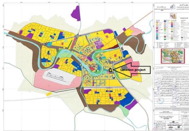
Fig. (2):- The location of the project in relation to the master plan for the city of Kut. Reference: Researcher