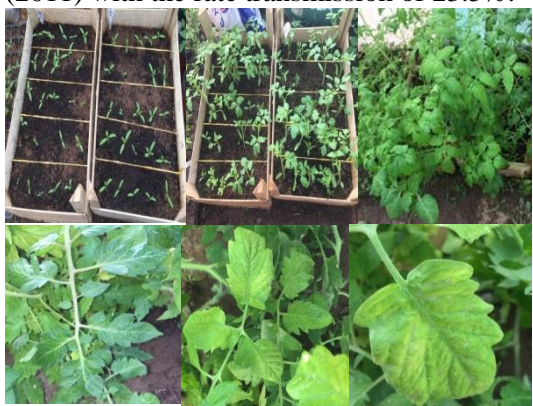
Fig. (4): Transmission of ToMV from seeds to seedling test, as shown by symptoms of ToMV.

Seedlings were germinated from 60 infected tomato seeds under plastic house conditions but only 4 exhibited ToMV symptoms of them (mosaic) as shown in (Fig.4), the virus succeeded to pass from seed coat to penetrate seedlings tissues causing systemic infection and the percentage of transmission was 7.8%. The similar results were found by (SevIk, and Kose-tohumcu, (2011) with the rate transmission of 23.5%.