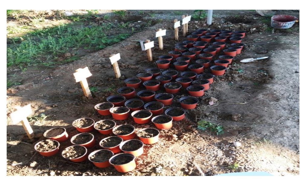
Fig. (2): A complete design of the research after planting tree seeds.