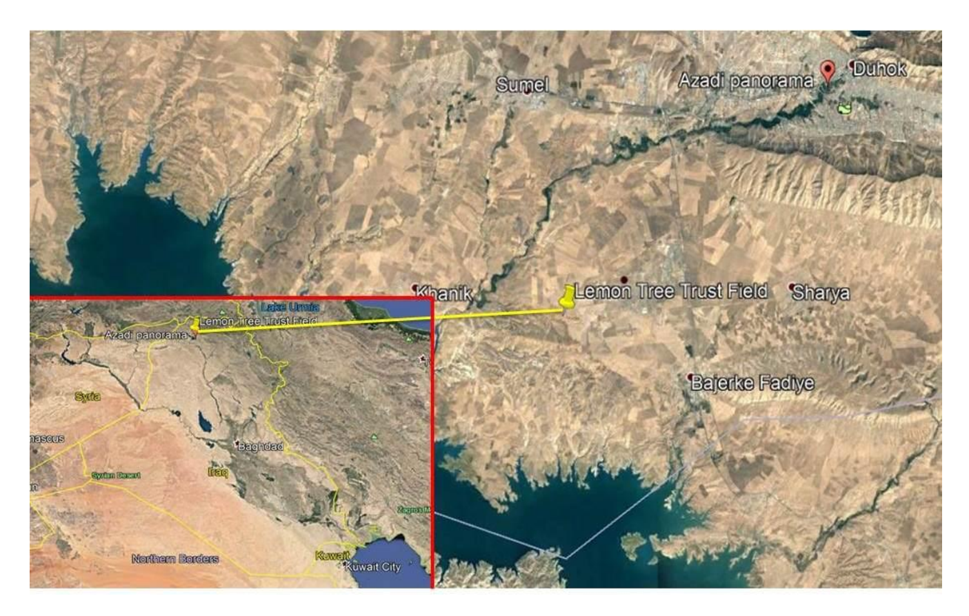
Figure 1: Location of Lemon Tree Trust Field at Domiz1 Syrian Refugee camp. 2.2. Fruit Collection and Seed Treatments :

The Celtis tournefortii fruits were collected in October, 2018 from Gara Mountain (Latitude: 37° 00' 49. 55) and (Longitude: 43° 21' 13. 01) elevation (2748m), then coat of these fruits have been removed by scratching it on the concrete ground, thus the study obtained the seeds without flesh coat. In this study, several presowing treatment have been tested in order to obtain the best treatment in the term of maximizing the germination rate. The study treatments were: