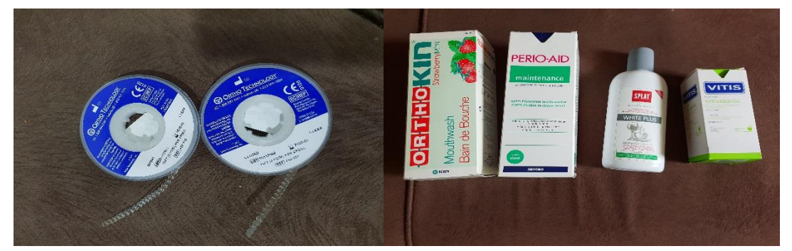
Fig, (1): Elastomeric chains

The level of decay in the orthodontic elastomeric chain for the study groups was determined in mean and Standard deviation. The comparison of decay level across agents in closed and short concertos was examined in ANOVA-one way. The comparison of mean values between closed and short connectors and comparison of mean difference (28 days-first day) between closed and short connectors and across agents were examined in independent ttest and one way ANOVA. At significant level (p \le 0.05) . The statistical calculations were performed by Statistical Package for Social Sciences version 25 (SPSS 25).