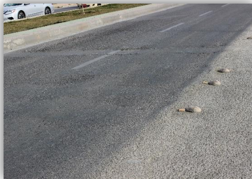
Fig. (8): Corrugation and shoving

The possible causes of rutting include heavy truck loading during high-temperature climates, lateral movement of materials or consolidation and problems in mix design such having inadequate quantity of pointed aggregate and unnecessary asphalt content or mineral filler all of them were proved in past . The most effective method that is suggested as a maintenance method for repairing this type of distress is based on the severity levels of the rutting, if the depth of the rutting is too small it can be left untreated otherwise deep ruts should be removed and replaced by new layer of pavement.