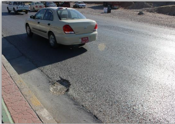
Fig. (6): Potholes

e) Potholes: Pothole, as shown in Figure 6, is a hole in a road surface that is created naturally to penetrate to the base course of the pavement from hot mix asphalt layer. The frequency of potholes and levels of severity are presented in Table 6. It can be seen that there are a lot of potholes with a variety of severities on the selected area. This type of distress causes the pavement to allow moisture to infiltrate the layers and causes roughness which can cause serious damage to vehicles going at high speed.