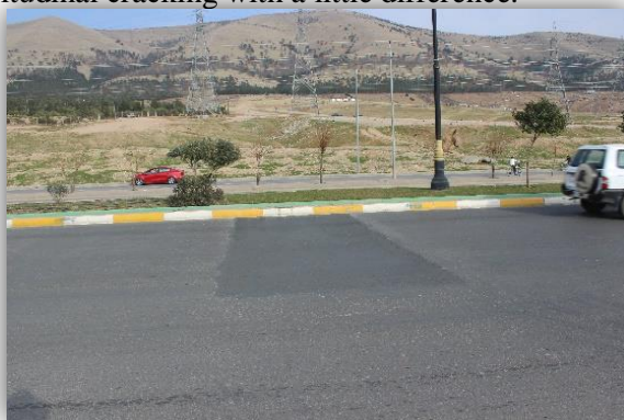
Fig. (5): Patching

d) Patching: Figure 5 shows the patching on the existing road. Patching takes place after repairing performed on the road where the original surface is replaced with added materials to the surface. The usual size of it, is more than 0.1m 2 .