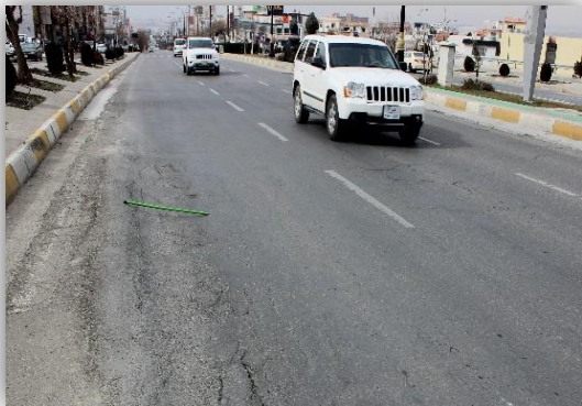
Fig. (7): Rutting

The possible causes of rutting include heavy truck loading during high-temperature climates, lateral movement of materials or consolidation and problems in mix design such having inadequate quantity of pointed aggregate and unnecessary asphalt content or mineral filler all of them were proved in past . The most effective method that is suggested as a maintenance method for repairing this type of distress is based on the severity levels of the rutting, if the depth of the rutting is too small it can be left untreated otherwise deep ruts should be removed and replaced by new layer of pavement.