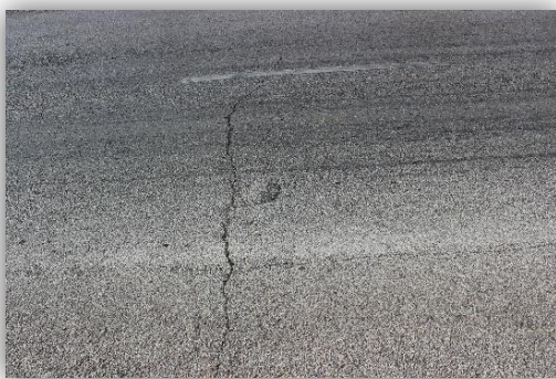
Fig. (4): Transverse Cracking

c) Transverse Cracking: Figure 4 shows a typical transverse cracking on the road. It is a crack which its direction is usually perpendicular to the direction of the longitudinal crack or the pavement centerline