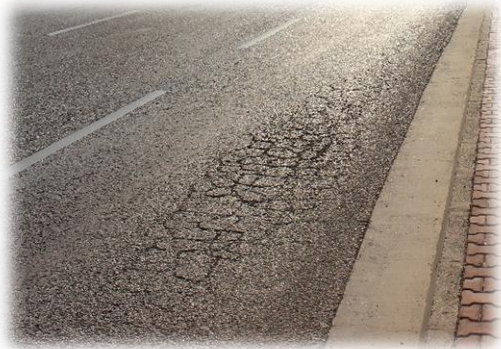
Fig. (2): Fatigue Cracking

a) Fatigue Cracking: Figure 2 shows an example of a fatigue cracking on the existing road. It looks like the back of a crocodile or an alligator that is why it is called an alligator cracking where a series of interconnected cracks