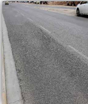
Fig. (10): Polished aggregate