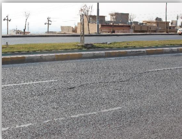
Fig. (3) Longitudinal Cracking

b) Longitudinal Cracking: Figure 3 shows an example of longitudinal cracking on the selected road. It is a crack that is usually parallel to centerline pavement regardless of the thickness of the crack.