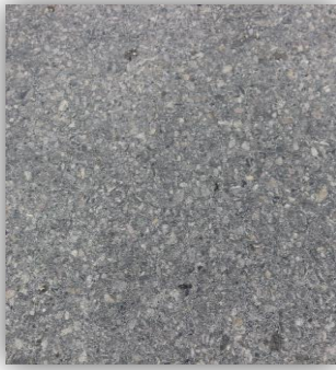
Fig. (9): Raveling